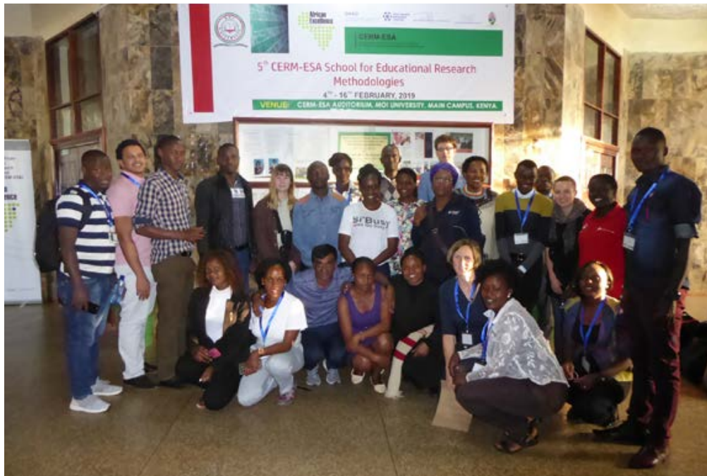
Participants of the 5 th Research School after a long day of learning about creative research methodologies in education

This year's Research School centred on the first year Master's and Scholarship holders who took up their studies in September 2018 (at Moi University and Ugan-