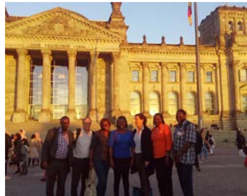
Visiting the German Bundestag

representative of Centres of African Excellence. An interactive presentation of the 11 Centres of Excellence and a Networking Session preceded the 19:00 Key Note Speech by H.E. Naledi Pandor, Minister of Higher Education of South Africa. A Roundtable Discussion "Contribution of CoE to the Aspirations of Agenda 2063" took place followed by a Reception for all meeting participants at 20:15. Friday, 12 October was dedicated to the Symposium "Critical Enablers for Africa's Transformation?" which was held at the Humboldt University. The registration for the meeting began at 9:00, Plenary Discussion with Alumni followed at 9:30 leaving place to the parallel working sessions throughout the day. A cultural visit of the German Parliament (Bundestag) took place from 17:30 for all the guests.