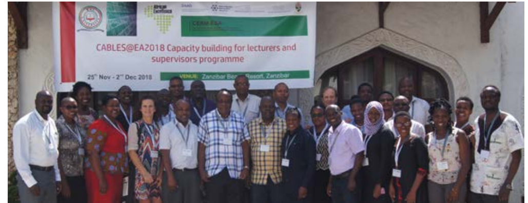
Participants and Facilitators of the Capacity Building Programme in Zanzibar