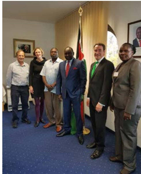
The Steering Committee with H.E. Amb. Magutt at the embassy

The celebratory event was entitled: 'Critical Enablers for Africa's Transformation – Contributions of the Centres of African Excellence to SDG's and the Agenda 2063' and offered space for exchange and networking between all ten Centres of African Excellence that operate in different countries of Sub Sahara Africa. All Centres aim to offer excellent education in their specific subject field and address challenges in their countries and regions. Besides CERM-ESA, there are e.g. the Centre in the Democratic Republic of the Congo, which deals with microfinance and innovations in the banking sector and a West African Centre operating in Mali, Niger and