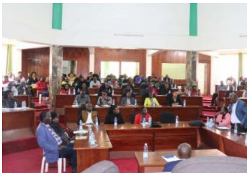
Postgraduate workshop in the CERM-ESA auditorium

dent in recurring statement that they "were glad to be referred to as associate students and would gladly attend future workshops as the workshops were very helpful". In terms of the shared perception that the programme was too packed, it was suggested that the overall length of the workshop can be done for a period of a week or each facilitator be assigned their individual full day session so as to achieve the desired objectives of the workshops. Each of these suggestions confirms the participants' interest in remaining part of the CERM-ESA postgraduate workshop programme.