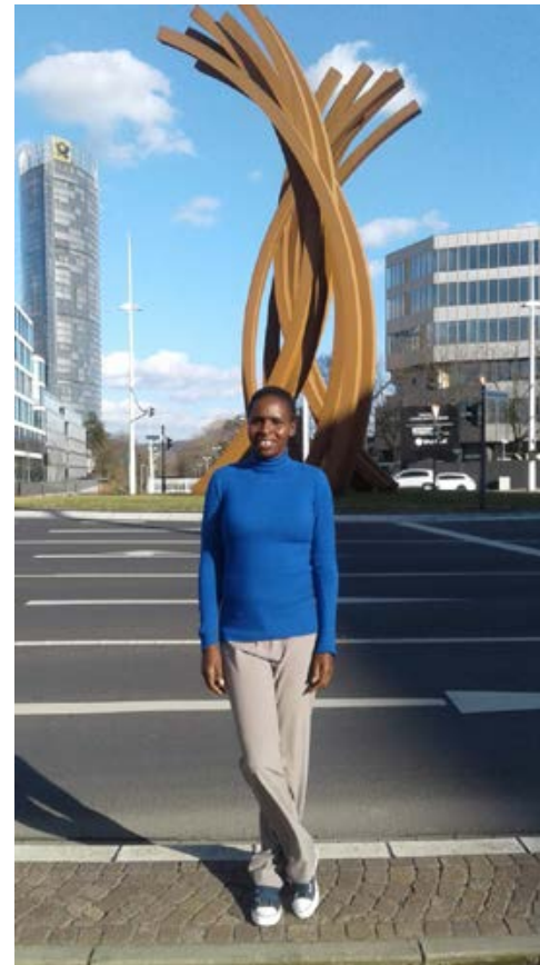
Touring the city of Bonn

the steering committee presented their requests and way forward for the AEN. We also had an interactive session with some of the officials of the DAAD German alumni. I truly appreciate the hospitality that we received throughout in Bonn, courtesy of DAAD.