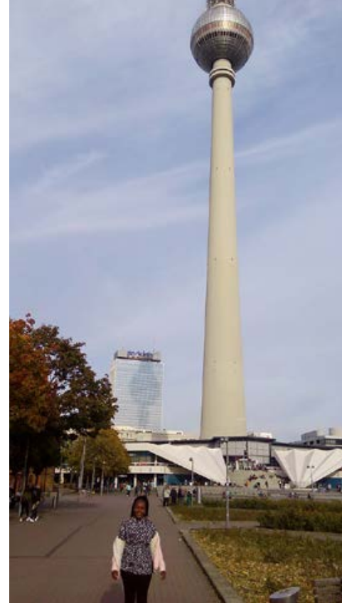
Berlin TV tower

ment in memory of the 6 million Jews of Europe during World War II. The site of the memorial belonged to an area which was created in 1688 by the third baroque extension of the medieval Berlin. The construction of the extension was begun in 1937 in the western part of the garden. Two years later, an underground bunker was added to the villa, which has survived to this day. The building was severely damaged during air-raids in 1944-45. During the construction of the Berlin wall in 1961, the ruins were completely demolished. With the gradual development of the "border security system" the area became part of the so called "death-strip". In August 1988, the journalist Lea Rosh and the Historian Eberhard Jackel made a public proposal for establishing a "high visible memorial for the murdered Jews of Europe" in Berlin. On 25th June 1999 after Germany's reunification and