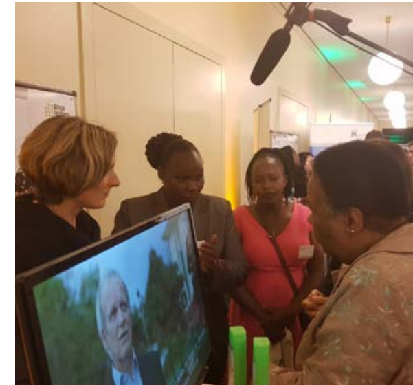
CERM-ESA coordinators explaining the Centre's work to the Minister of Higher Education of South Africa, H.E. Ms Naledi Pandor, and DAAD's president, Prof Margret Wintermantel