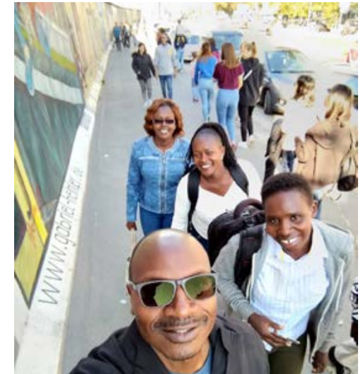
The Berlin Wall

I miss the walk along the Berlin historical wall, the colorful night view of Berlin city full of monuments from the rooftop of Park Inn Hotel. This opportunity widened my view – much appreciation to DAAD and the organizers of this event.