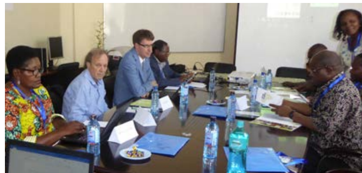
CERM-ESA Steering Committee at work